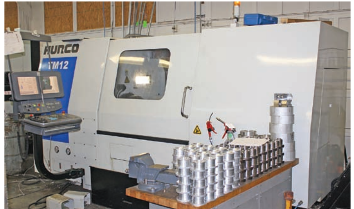
The TM12 was the company's first Hurco lathe purchase. The lathe is used to turn everything from large aluminum castings to small steel and aluminum bar.

Innovators West Waddle's Manufacturing Salina, KS 67401