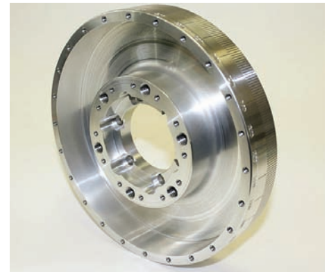
This part was machined from 7.5" diameter 6061-T6 aluminum bar by Waddle's Manufacturing & Machine. It is the case to a Big Block Chevrolet harmonic damper that is sold by Innovators West.

"As the machinists at Waddle's Manufacturing have learned, machining with the TMX8MYS mill turn machine means fewer setups and less material handling which equals greater productivity and profitability," said a company spokesperson. "While the specifications of the TMX8MYS are impressive, the control's intuitive user interface that simplifies programming and operation is what differentiates it from others in its class. For example, by simply checking a box, the control activates linear Y-axis motion. The sub-spindle functions are similarly straightforward. The control has multiple milling strategies to simplify programming, such as lines and arcs, circle, frame, slot, axial flats, and/or lettering."