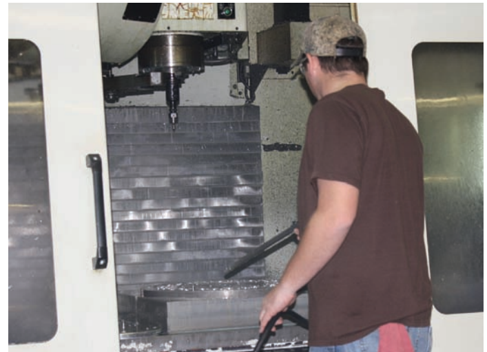
Waddle's operator is clearing a fixture of chips in preparation for another large flange.

technology and a knowledgeable representative led us to choose Hurco as the next line of machine tools. Hurco appeared to be on the cutting edge of software design, and also had solid well-built hardware," said Waddle. "We also got a great feeling dealing with Hurco distributor Gage Machine Tool. They took the extra time to answer all of our questions and reassure us that they were there for us should we need any help down the road. They have followed through with those promises