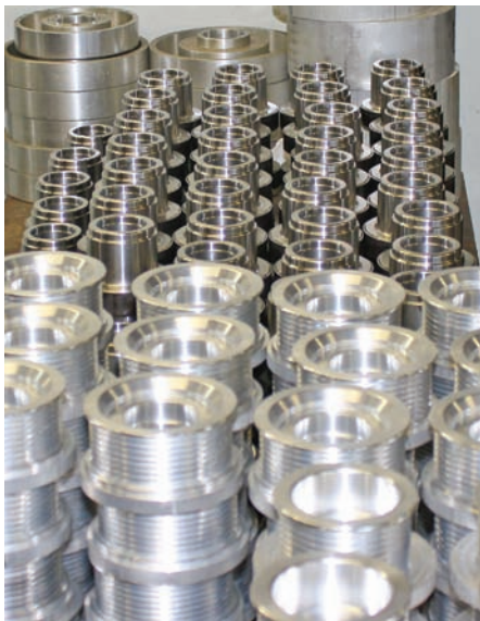
Shown are accessory drive pulleys and harmonic damper hubs. They have gone through the first operation and are ready for the second operation.

When the company's fleet of machines started to age, it had to find a replacement line of machinery that would provide the same or better quality of parts the shop was producing at a competitive price. "We interviewed several machine